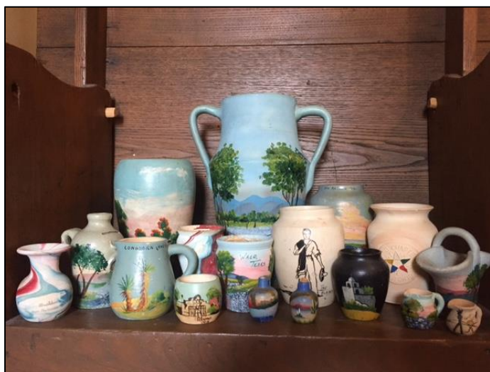
A selection of Meyer souvenir pieces

In 1887 Meyer married Schultz's daughter. The two potters purchased 5 acres for $25 and operated their own pottery business. Meyer and Schultz produced a number of utilitarian wares including jugs, crocks, jars, bowls and pitchers. The first few years they used the typical salt glaze method. In 1895 Meyer found a unique source of clay in the Leon Creek where the future Kelly Air Force Base was to be built. The use of this clay, and now famous Leon slip, would give the finished wares a range of colors from bright mustard yellow to brown to an olive green and sometimes all three colors on the same piece. The potters used a style of handle called a body strap where the handle was attached only on the body and not to the neck or mouth. Meyer purportedly could throw 100 ten gallon crocks in a day.